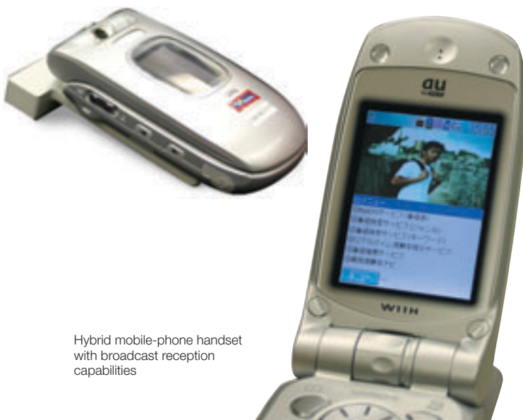
Hybrid mobile-phone handset with broadcast reception capabilities

Commercialization of CDMA2000 1x EV-DO technology and technical support provided by R&D teams at KDDI played a major role in the launch of the au WIN service in Japan in November 2003. Original image compression, processing and editing technologies developed in-house underpin the extremely high quality of the live video and video streaming components of the new service. Technology developed by KDDI also supports a number of new EZ Channel services that provide users with rich creative possibilities based on flexible combination of video and graphics elements. Alongside these achievements, KDDI also developed related technologies, including original valuation methods for high-speed data communications characteristics and new inter-network optimization processes between base stations. Together, these enable the realization of high-throughput in the commercial service. Furthermore, KDDI has also developed relay stations (repeaters) that can extend the coverage areas at lower costs than existing conventional base stations to provide services in the new 2GHz high-frequency band. Reducing the cost of constructing and operating a 2GHz wireless network infrastructure promises to make KDDI mobile services even more competitive.