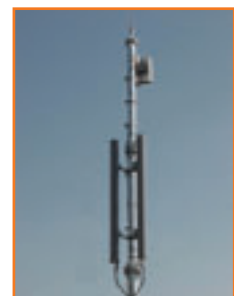
Antenna installation at repeater station