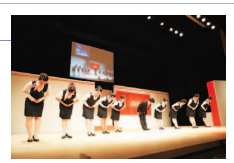
au shop staff demonstrating their customer service skills

We aim to maximize customer satisfaction by encouraging the spread of customer service skills on display at this contest to all our shops.