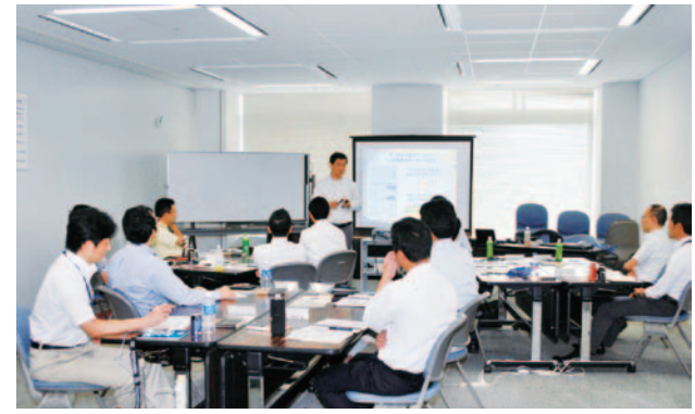
Practical skills training for employees working overseas

The Mission Grade System that we introduced for managers in FY2013, clarifies the management roles of line managers and the professional roles of managers in non-line positions, setting their rank in accordance with the size of their roles. Rather than being evaluated on past operating performance, under this system the rank is defined according to their responsibility, authority, and degree of influence on the basis of current job performance. Our compensation system is designed to reward employees in accordance with their level of contribution.